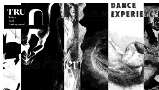
Illustrations: Yo ISHIHARA

Butoh was not just at the forefront of the avant-garde art movement, it has also had a number of connections with the entertainment and commercial worlds. Butoh dancers have historically appeared in a variety of fields, as performers in cabarets, commercials, a film for the 1970 Osaka World Expo, as backing dancers in music videos and, more recently, on popular TV dramas. This illustrated timeline looks at the various connections with media and other art styles that Butoh has had, even as it continued to inspire society.