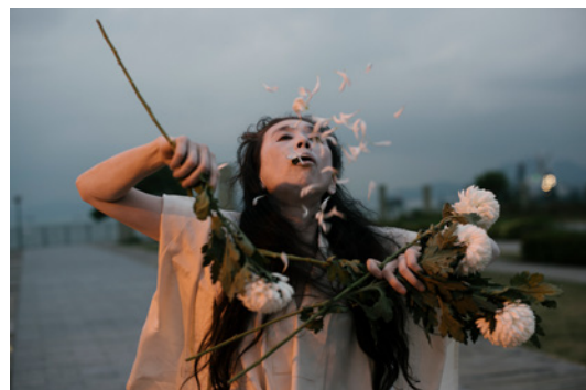
Eiko Otake— A Body in Hong Kong