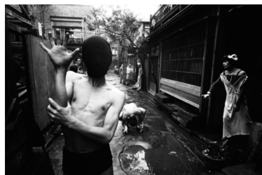
William Klein Crab Dancer ©William Klein, Tokyo 1961

William KLEIN first came to Japan in 1961 and stayed for around two months, taking photographs all over Tokyo before publishing them in Tokyo in 1964. Of these, 10 of the photographs taken in Ginza have been selected for a large wall display. How did this world-famous photographer see Tokyo in the chaotic excitement leading up to the Tokyo 1964 Olympic and Paralympic Games? This urban exhibition thrusts scenes from 60 years ago upon the surrounding landscape.