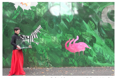
The Butterfly Dream, above ground ~Big Fountains in Ueno Pari